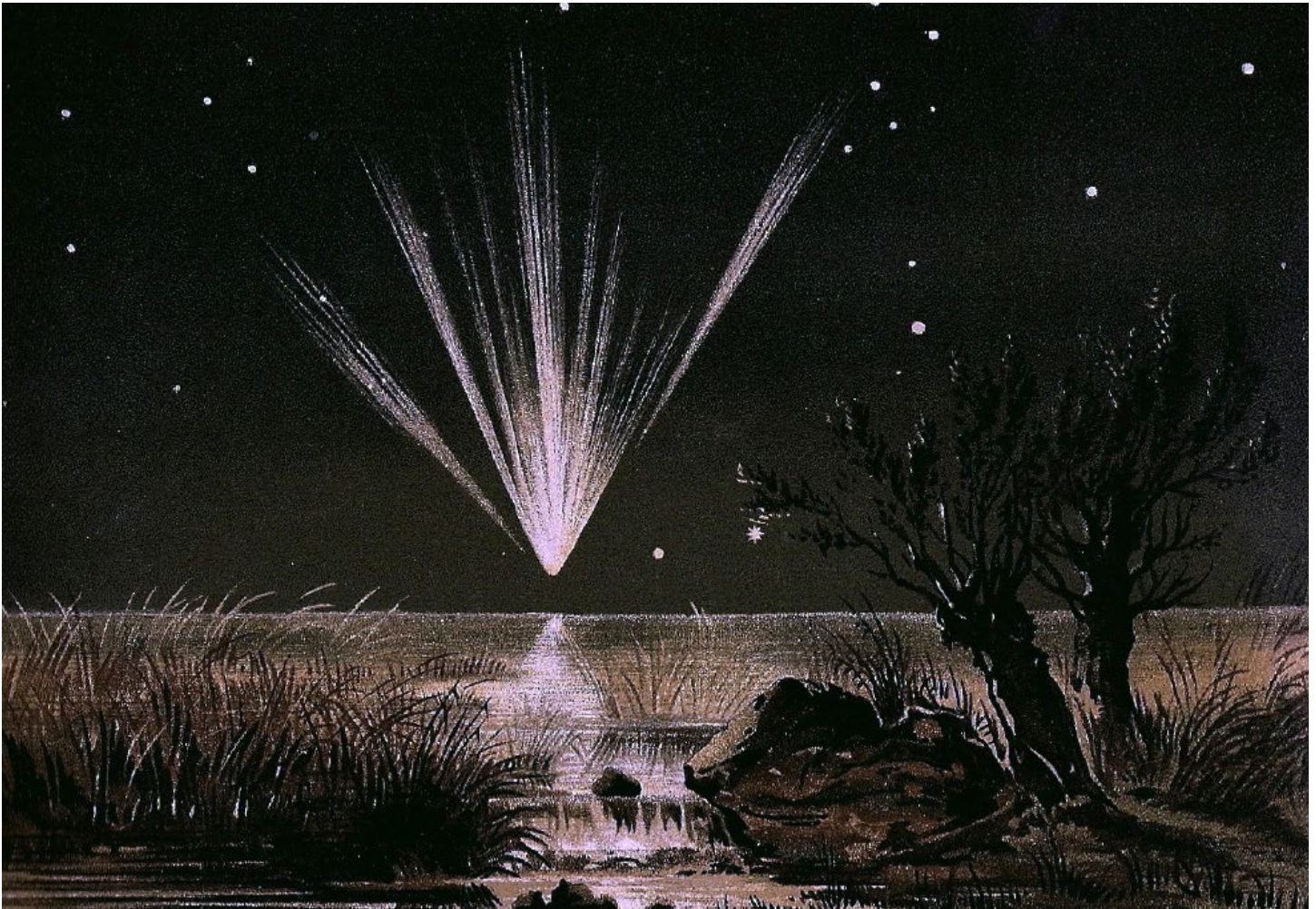
Comet Tebbutt on June 30, 1861, as sketched by Austrian astronomer Edmund Weiss. Capella is the bright star to the comet's right, and Cassiopeia is in the upper right.

Perihelion: 1861 June 12.01, q = 0.822 AU