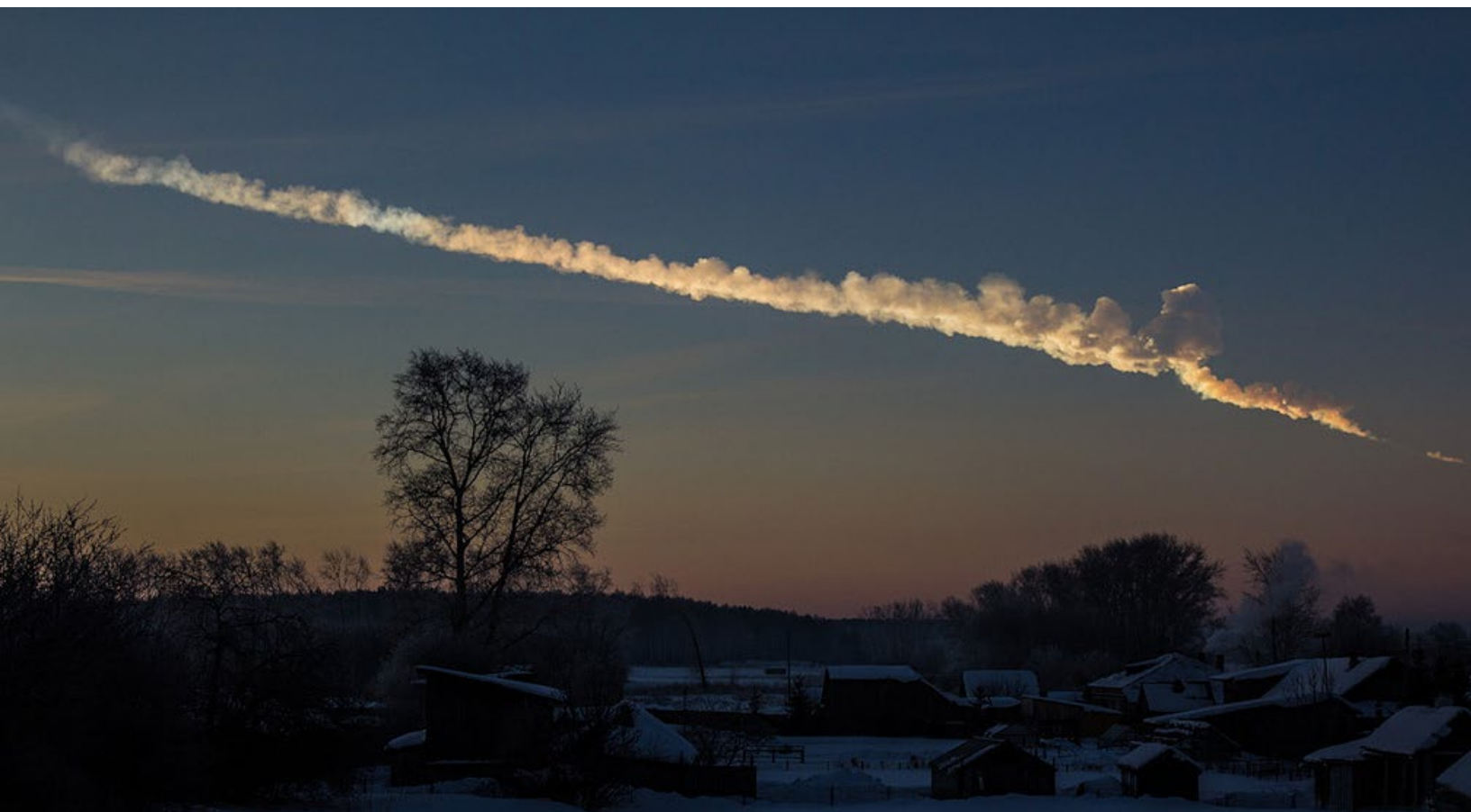
The Chelyabinsk meteor of February 15, 2013.

on a rather frequent basis. Estimates for the average frequency of impacts of Tunguska-size objects have ranged from once every few centuries to once every few millennia, with most recent estimates favoring the longer-time range of that timespan. At the same time, there are even larger numbers of smaller objects, and consequently we might expect that these will impact Earth (or, at least, Earth's atmosphere) with an even higher frequency. Since 1908 there have been at least two such events, and via an interesting coincidence both of these, as well as the Tunguska Event itself, have all taken place within present-day Russia.