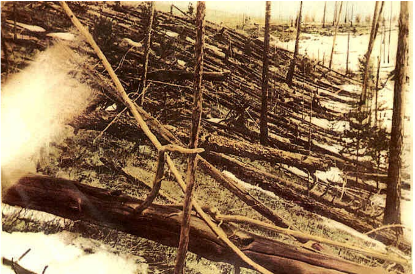
Photograph of the Tunguska Event's impact site taken by Leonid Kulik's expedition in 1927. Most of the trees are knocked flat, radially extending outward from "ground zero."

During the early morning hours on Tuesday, June 30, 1908, at around 7:17 A.M. local time, "something" entered the earth's atmosphere near the Pacific coast of Asia, traveling northwestward. A few km above the surface of a largely uninhabited region of central Siberia, near the Stony Tunguska River some 90 km north-northwest of the village of Vanavara, this object exploded with a force that is presently estimated to have been approximately 10 to 30 megatons, and according to eyewitness accounts was as bright as, perhaps even brighter than, the sun.