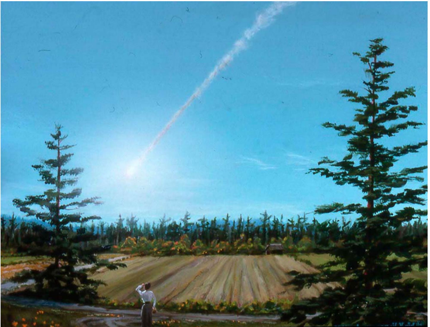
Artist's conception of the Tunguska Event, as viewed from the town of Kirlensk (60 km distant) two seconds before the explosion.

inhospitableness – it is a mosquito-infested wilderness, with much of its being marshland – in part because of political events such as the Bolshevik Revolution, and in part because of local taboos concerning the event itself, it was almost two decades before any scientific expeditions to the site were conducted. The first such expedition was led in 1927 by Leonid Kulik from the Soviet Academy of Sciences. After an arduous overland journey Kulik and his group reached the site in the late spring of that year and witnessed an incredible sight of devastation: over an area constituting approximately 2000 square km around the site trees has been uprooted and knocked to the ground, with their trunks pointing back toward “ground zero.” Forest fires resulting from the heat of the explosion had burned much of the surrounding vegetation.