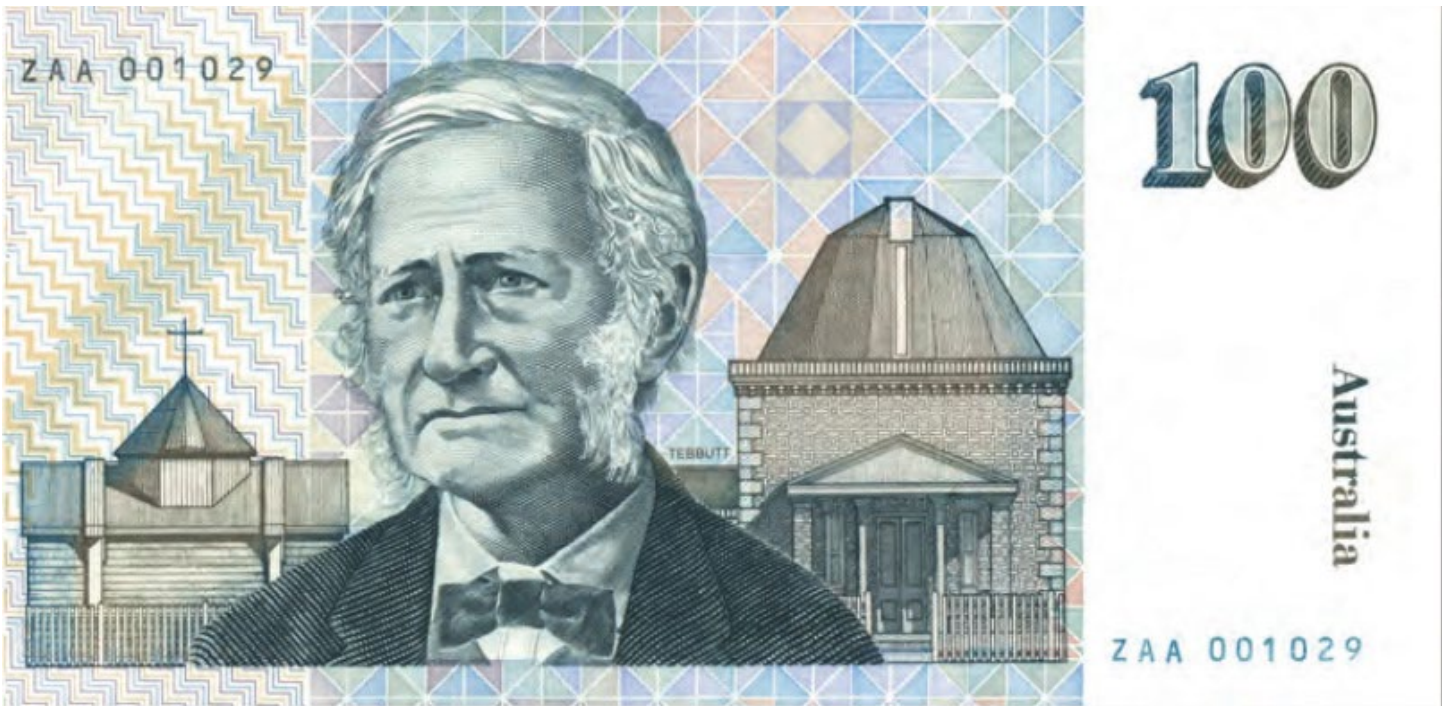
Back side of the AUS$100 banknote from 1984 to 1996, featuring a portrait of John Tebbutt.

sun at that time, thus briefly exhibiting a phase angle in excess of 165 degrees and accordingly a dramatic brightness enhancement due to forward scattering of sunlight. It was traveling northward at over 10 degrees per day at the time, and right around the 30th suddenly became visible from the northern hemisphere as a brilliant object of magnitude -2 or brighter. Because of the viewing geometry the tail was broad and structured, and according to several observers stretched over 90 degrees on the sky. Several observers reported the comet as being bright enough to cast shadows. It appears that Earth might actually have passed through part of the comet's tail around the time of closest approach.